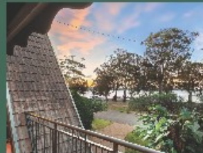
100 Dilkera Avenue, Valentine. 4 Bed | 3 Bath | 5 Car