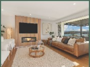
14 Farm Street, Speers Point. 4 Bed | 3 Bath | 2 Car

On the market and in demand in your neighbourhood.