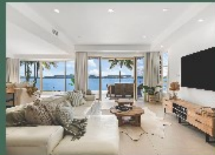
75 Marks Point Road, Marks Point. 4 Bed | 3 Bath | 5 Car