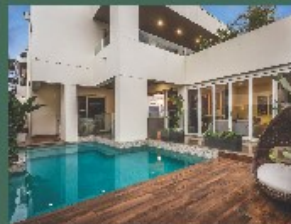
16 New Road, Warners Bay 5 Bed | 3 Bath | 2 Car