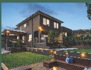
14 The Park Chase, Valentine 5 Bed | 2 Bath | 2 Car

On the market and in demand in your neighbourhood.