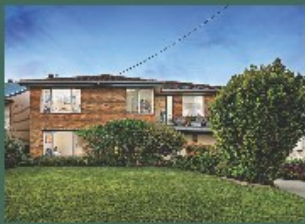
21 Victor Avenue, Valentine 4 Bed | 2 Bath | 2 Car