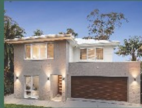
1 Lurnea Crescent, Valentine 5 Bed | 3 Bath | 2 Car