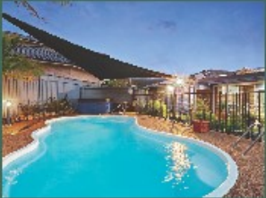
17 Arundel Place, Valentine 4 Bed | 2 Bath | 2 Car

On the market and in demand in your neighbourhood.