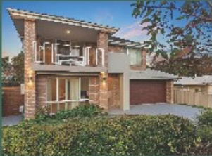
2 Gregory Parade, Warners Bay 6 Bed | 3 Bath | 2 Car